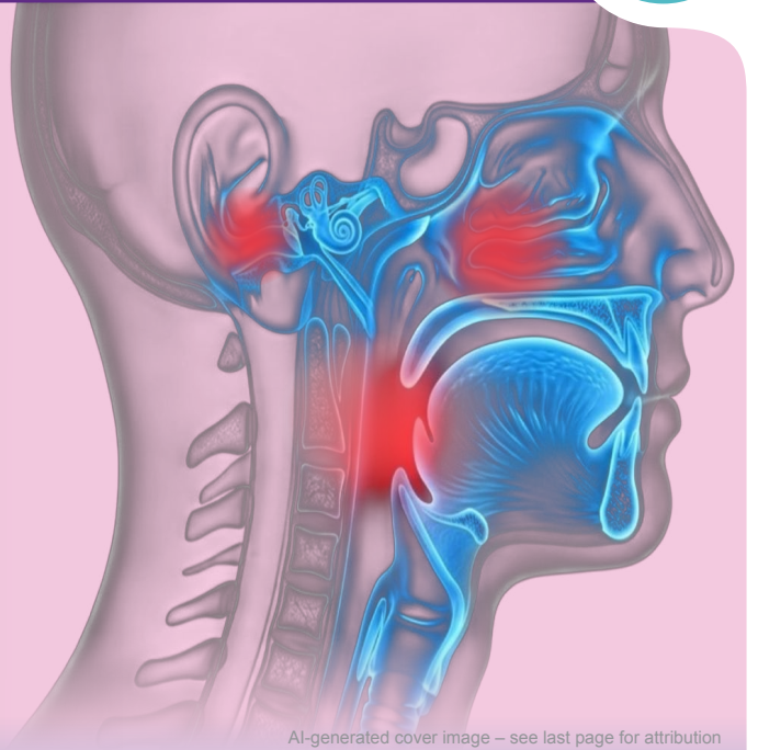
AI-generated cover image – see last page for attribution